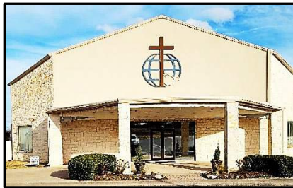
Figure 1: Same church two years after sealing.

NewEraSOS™ has successfully combined two emerging Nanotechnologies to address multiple problems of surface protection against erosion, soil adhesion, UV damage, atmospheric biofouling, and staining with a “vitrified Nano-metal oxides” fusion that works with light and the weather to keep surfaces clean. It enhances “curb appeal,” extends asset life, and minimizes future cleaning with photocatalytic oxidation (PCO), a fascinating phenomenon of Nanotechnology.