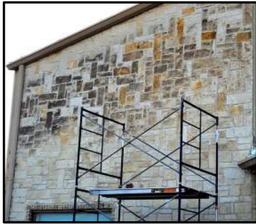
Figure 2: Left (N.W.) side of Texas limestone church stained by mold and pollutants prepared for deep cleaning.

It is the most advanced Nano-chemistry masonry sealer available. Nano-technology delivers deep penetrating protections and unique features to enhance your masonry surfaces and maintain a like-new look.